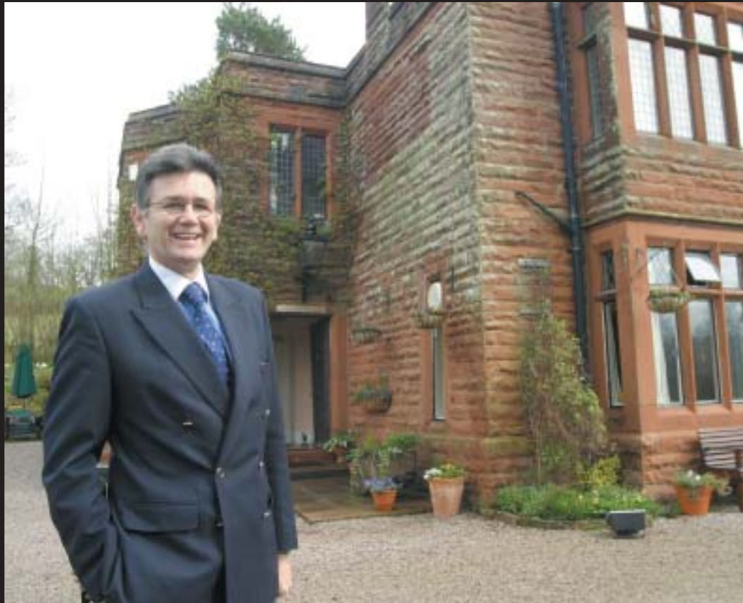
The Heatherglen Country Hotel relies on Calor LPG for heating and catering.

“ The oil heating was noisy, it emitted fumes and the storage tank was unsightly - it was just not in keeping with the quality of the hotel or the picturesque surroundings. ”