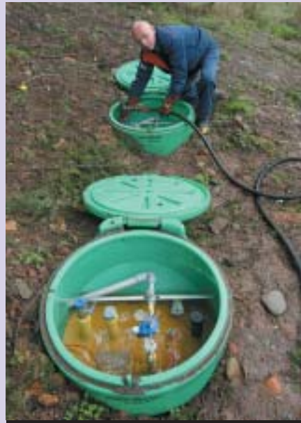
Calor's underground tanks provide a constant and economical source of LPG.

Two 2,000 litre tanks are installed underground at the side of the main building and are topped up every week during the winter months and once a month during summer. "All you can see is two green lids," says Alan. "The tanks are discreetly located underground so not to deter from the beauty of the surrounding countryside and building."