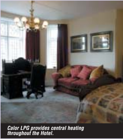
Calor LPG provides central heating throughout the Hotel.

The Heatherglen Hotel offers seven rooms, all with LPG central heating and water heating. The decision to convert the heating system from oil to LPG power was made by Alan, he says: "The oil heating was noisy, it emitted fumes and the storage tank was unsightly - it was just not in keeping with the quality of the hotel or the picturesque surroundings."